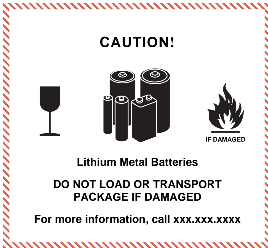
Figure 7.4.H Lithium Battery Label